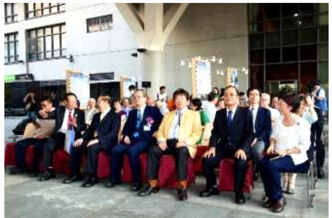
Guests listen to music played by the student band