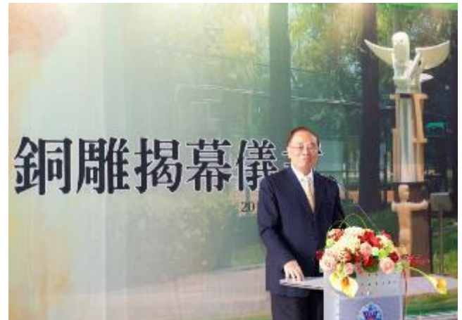
Executive Yuan Former Premier Mr Chun H. Chang