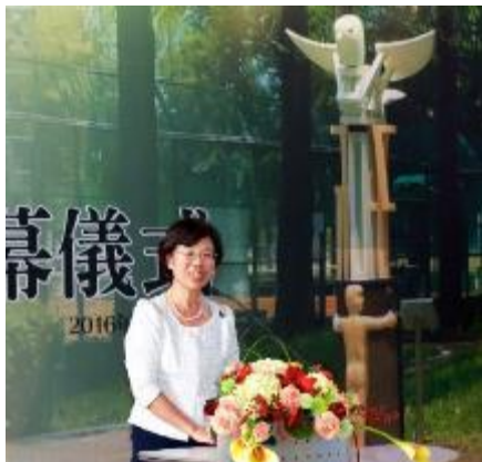
Senator Dagmar Yu gives a speech